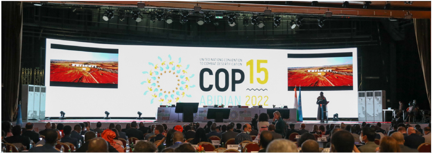
15th session of the Conference of the Parties to the UN Convention to Combat Desertification, held in Abidjan from 9 - 20 May 2022, supported by Indico.UN.